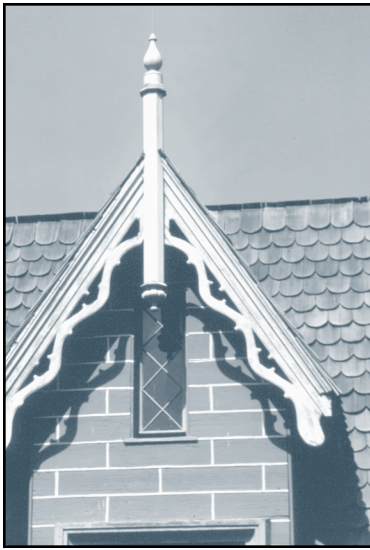
Gable Detail, The Hermitage, Ho-Ho-Kus Borough. SR Listed 5/27/71